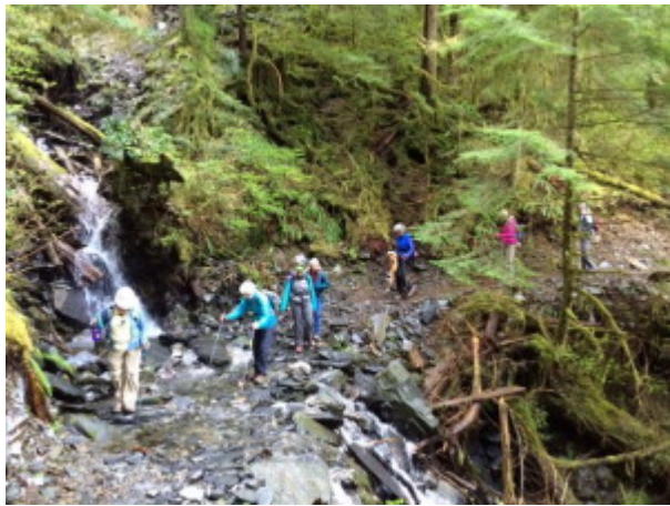
Hiking sultan canyon trail off hwy 2 in the North Cascades

The blessing is not being in pain. I stopped taking Shaklee's Pain Relief Complex which inhibit the pain path without any side effects. Low and behold, other arthritis pain showed up in my hands. I don't hike as far as the other members of my gang of hikers, but I am strong enough to lead the pack and am pain free. My hiking friends have been solicitous, gradually increasing the length and the elevation gain. Last week and next will be 700 ft of altitude gain and six miles round trip (Boulder Creek trail of Hwy 530). I know it well and there are places to stop if I need to let the others go on.