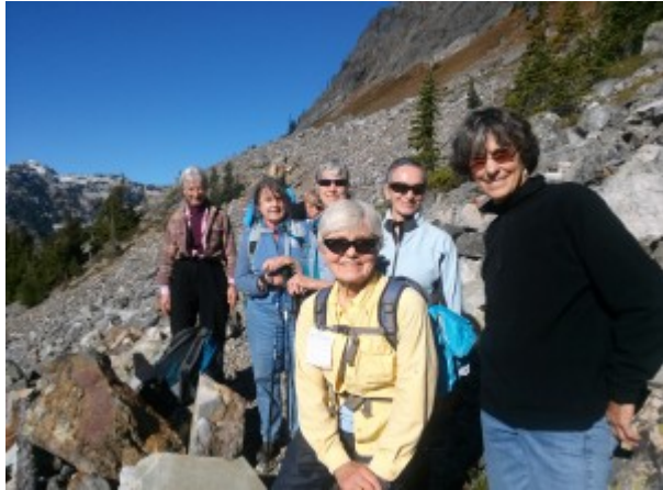
Women on Wed.hike to Red Pass on the Pacific Crest Trail

In my pack I carry a tape made by a German company. The product is called Hansaplast and is not available in the US, only Canada and Mexico in North America. But of course anywhere in Europe you can purchase rolls of this magical thin, easy-to-tear-with-your-fingers tape. If I'm not going to Europe, I ask a traveling friend to buy it for me. Usually I put a piece of this tape on the areas of my feet most likely to blister in my hiking boots before I begin the hike . Usually, if I feel a hot spot, the way I did when we hiked out of Commonwealth Basin up the Pacific Crest Trail toward Red Pass, I stop on the trail and take off my boots and sox and put the tape on, thus preventing a blister. But on Rattlesnake Ridge, I ignored everything I usually do.