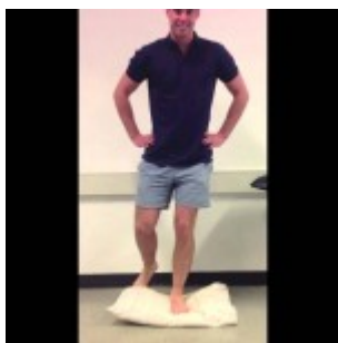
Picture ski poles and squats on an uneven surface like this pillow