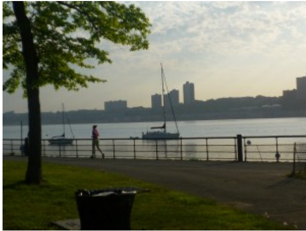
New York's back yard, walking along the Hudson