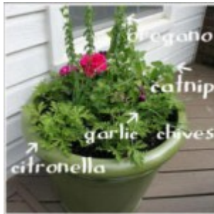
Plants to repel mosquitoes

Bug-repelling plants such as marigolds, tansies, Thai lemon grass, citronella