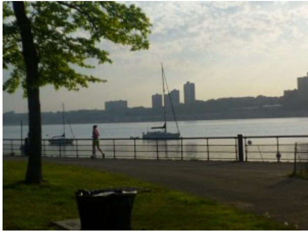
New York's back yard, walking along the Hudson