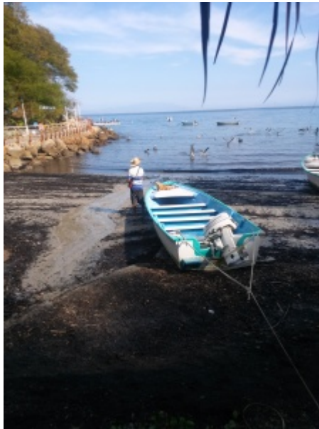
Pier and harbor in Quimixto