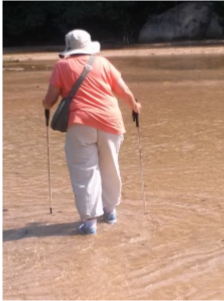
wading the stream in Quimixto