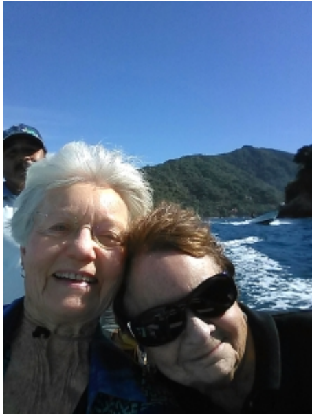
A fine boat ride to Quimixto.

Once we were settled and had a look around, we were smitten by the place: an unbroken view of the ocean, waves crashing just beyond the low wall; majestic native trees rising out of pale blond sand; pelicans swooping along the wave crests; the occasional horsed rider passing by on the beach. Raul's wife brought us a fabulous dinner of fresh mahi mahi and homemade tortillas. I made fresh lime margaritas and guacamole from the groceries I had bought in the Mega Comerciante while waiting for my s-in-l to arrive. The kitchen was a dream to cook in with its gas stove, big counter and all the condiments you could ask for plus every insect repellent you could imagine. I did get a few sand flea bites, but no mosquitoes. The air was fresh, the stars brilliant after the full moon set. The hammock perfectly located on the veranda. We each had our own bedroom and bath, not luxurious, but homey and comfortable.