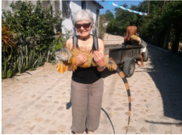
Iguana photo op