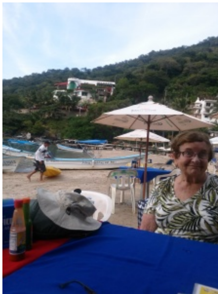
Waiting for the taxi in Boca de Tomatlan

So imagine my relief and my delight when these gals said, “Yes” to every adventure, walked the vast campus of the Gran Mayan complex, took a public bus home from the Puerto Vallarta Arboretum way south of town and climbed the steep ramp to worship at the great church of the Virgin of Guadalupe in downtown PV.