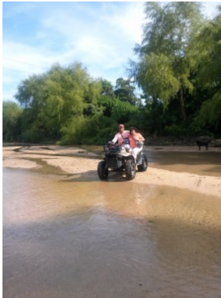
Alternative route across the river

I put on my tevas and replaced them with walking shoes on the other side. The village is about five cobble stone paved blocks along with a pier at the far end and a few shops, an open church and a primary school plus private houses along the way. The little harbor is full of open fishing boats.