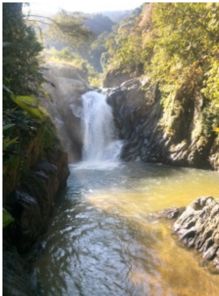
Waterfall above Quimixto

Vallarta Adventures brings a boatload of tourists from the cruise ships in to Quimixto and takes the people walking through town to a corral where 20+ Mexican ponies wait. Once the tourists are saddled up and instructed, they file up a trail to a dramatic waterfall about a mile and a half up into the jungle. I decided to walk this and had to cross the “creek” four more times, climb quite a bit to a bar perched on the edge of a deep pool into which the waterfall plunged. The tourists arrived by horse back after I had my viewing spot picked out, a good place to watch them jump in the water, haul the brave ones up hand over hand to a ledge and shoot down the water fall’s natural sluice. Enterprising locals had souvenirs for sale and one man offered me a giant iguana for a picture. And a tip, of course.