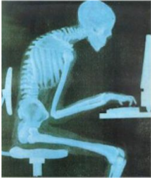
sitting is killing us