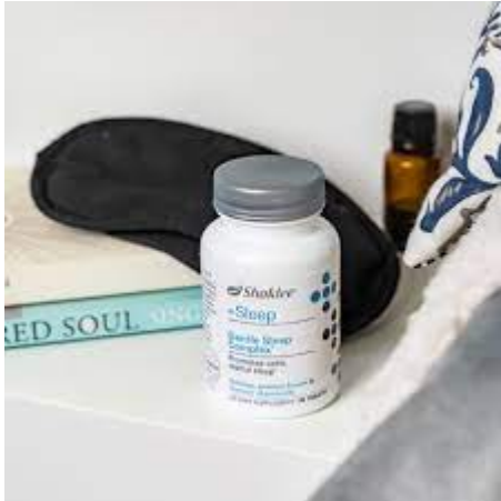
A restful night's sleep.

apnea. This disorder causes you to stop breathing intermittently while you're asleep, putting you at greater risk for heart attack, stroke, and atrial fibrillation. Ask your doctor about CPAP therapy and other options.